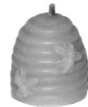
Small beehive $3 50 ea