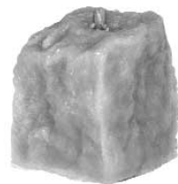
Rock candle $11 00 ea