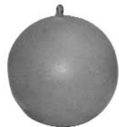
Small $5 00 ea Large $15 00 ea