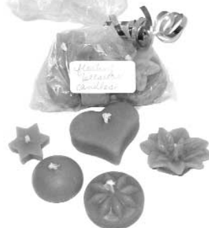
Floating candle gift pack Five per pack $12 00 ea