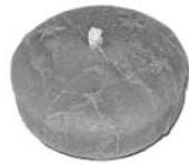
Large floating candle $7 00 ea