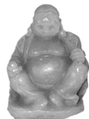
Tiny smiling Buddha $3 00 ea (no wick)