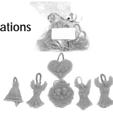
Christmas tree gift pack Six per pack $12 00 ea