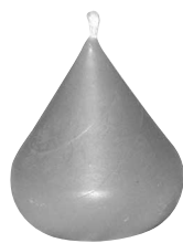
Small teardrop $7 00 ea