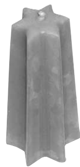
6-point star $20 00 ea