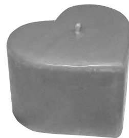
Large heart $35 00 ea