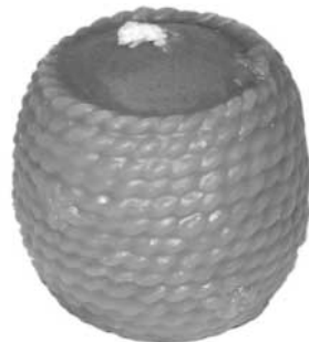
Large beehive $16 00 ea