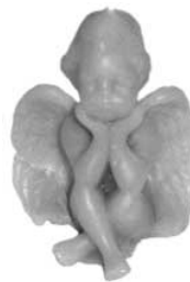
Small cupid $7 00 ea