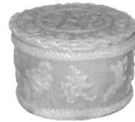
Beeswax jewellery box $40 00 ea